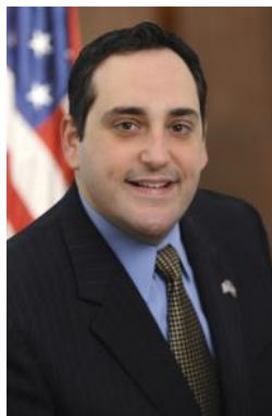
Chad A. Lupinacci Member of Assembly 10 th District Suffolk County