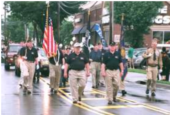
Our marchers looked sharp despite the rain

This Memorial Day proved to be one for the records. In the morning, we came close to having the parade cancelled due to weather, but it went off after a 15 minute delay. It drizzled a short while but we were no worse for wear. The community came out and