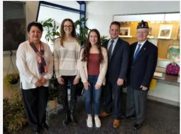
American Legion Auxiliary Unit 1244 is sponsoring the Harborfields delegate.