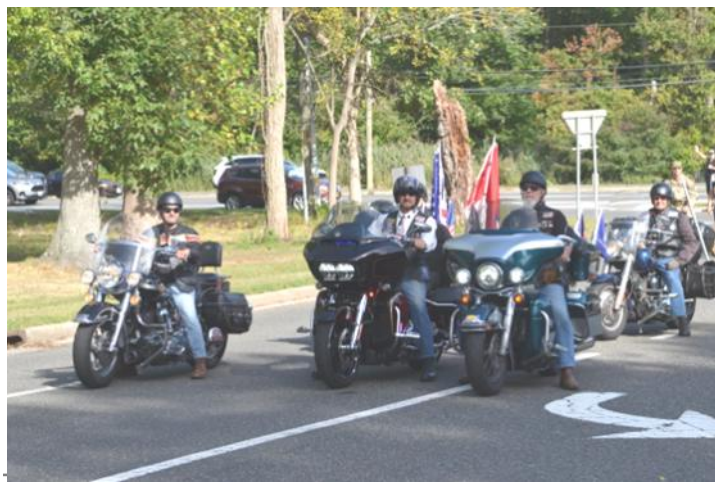
Post 1244 Riders escorting the walkers to Armed Forces Plaza at the H. Lee Dennison Building in Hauppauge