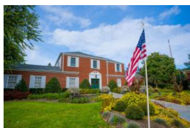
NOLAN FUNERAL HOME Est. 1948

57 East 24 th Street, Huntington Station, NY 11746