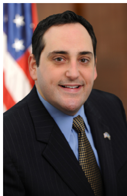
Chad A. Lupinacci Member of Assembly 10 th District Suffolk County