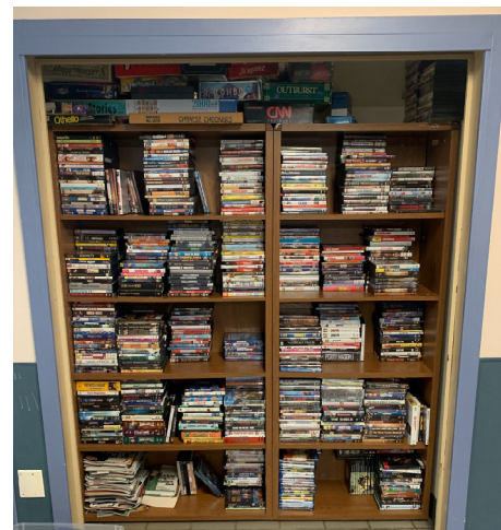
Completed DVD Library Building 92 Northport VAMC

The collection has 913 DVDs! Excess DVDs that I