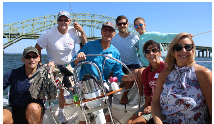
One of the eight participating sailboats from the Babylon Yacht Club