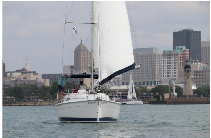
Setting Sail in Buffalo. One of nine participating sailboats.