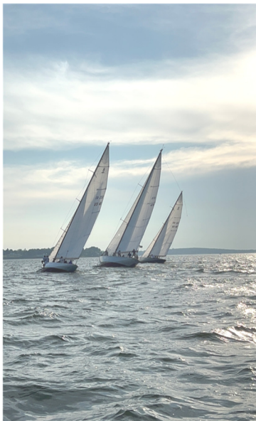
Weekly Sailing on the Classics

This year, SailAhead proudly introduced two new events to its calendar, broadening its impact across the country. Buffalo Harbor Sailing welcomed 40 veterans and their guests aboard nine boats, providing an opportunity for veterans to experience the therapeutic benefits of sailing in a new region.