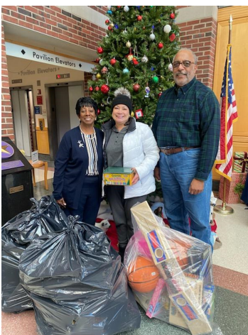
Northport VA Medical Center Services for the Underserved

Angels for Warriors assists and guides Nassau and Suffolk County Veterans, active duty military, and their families through essential resources, with an emphasis on pro-bono and low-bono legal representation.