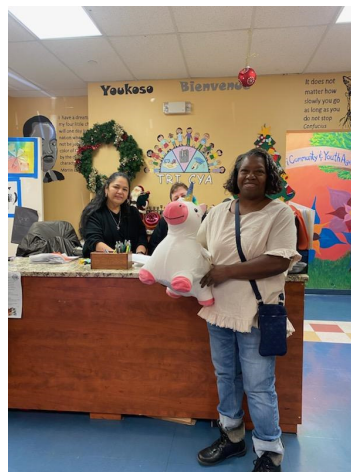
Long Island Cares