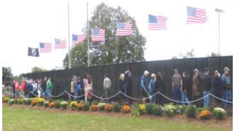
Dignity Memorial Wall Last October in Peter Nelson Park

This celebration will also honor those who are in service today and the veterans of all wars because; we are all one with one common goal; to preserve freedom as we have known it for more than 200 years. Now is the time to step up and say I want to join in and help! Work side by side with veterans and supporters to accomplish our mission. The Vietnam Veterans of America Chapter 11 are leaders, partnering with Northport VA Medical Center and Dignity Memorial to make this an experience of a life-time. Please be part of this worthy cause and join us,