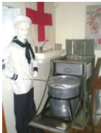
US Army M1937 Field Range

Everything from uniforms to dog tags and boots, medals and mess kits were donated by local veterans or their families for the exhibit. There was even a vintage M-1937 Field Range from WW II in one corner.